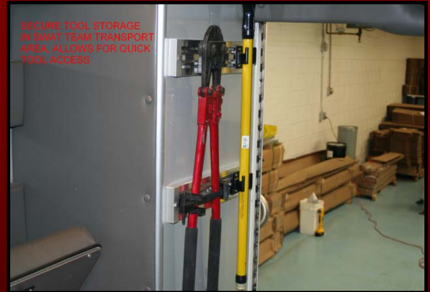
SECURE TOOL STORAGE IN SWAT TEAM TRANSPORT AREA. ALLOWS FOR QUICK TOOL ACCESS

SWAT Crew Transport Area Mounting Was Kept To A Minimum To Create As Much Team Member Space As Possible. A Set Of Bolt Cutters, Two Fire Extinguishers, A Pike Pole, And A Battering Ram Were Mounted Within This Space For Immediate Access By Team Members.