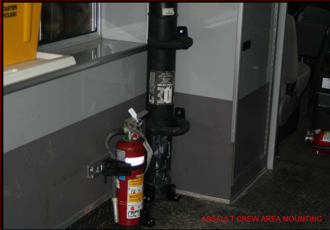
ASSAULT CREW AREA MOUNTING