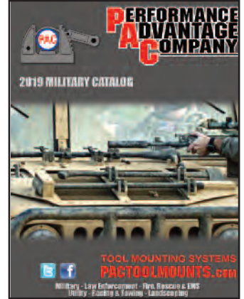
PAC's Military Catalog