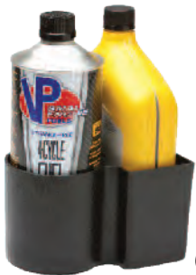
(P/N 1041) INTRODUCTORY PRICE: $89.95