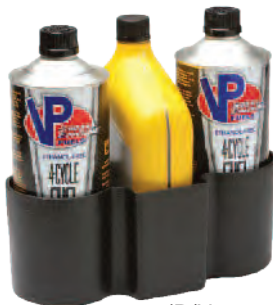
(P/N 1041-1) INTRODUCTORY PRICE: $99.95