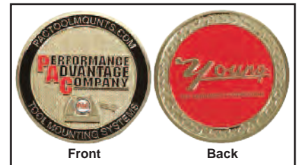
PAC's Challenge Coin