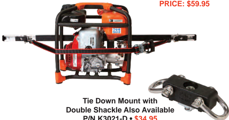
Tie Down Mount with Double Shackle Also Available P/N K3021-D • $34.95