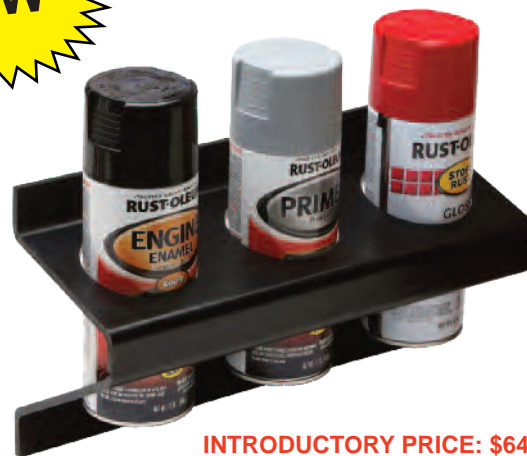
INTRODUCTORY PRICE: $64.95