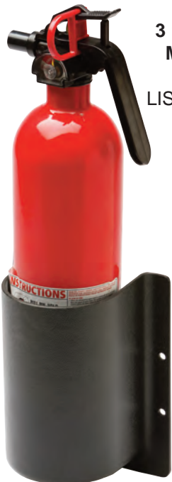
3 1/2" CYLINDER MOUNT - TALL (P/N 1044-3) LIST PRICE: $42.95