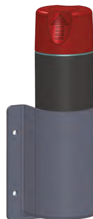
2 1/2" CYLINDER MOUNT - TALL (P/N 1043-3)