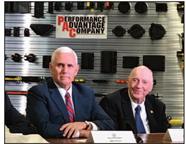
Vice President Pence Visits PAC