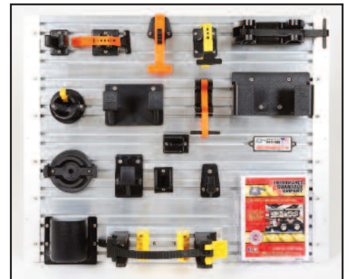
TOOL BOARD SHOWN IS DEMO-TB3 CALL FOR INFO/PRICING